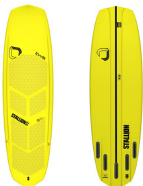
BWSurf Kitesurf Boards Various sizes & styles available