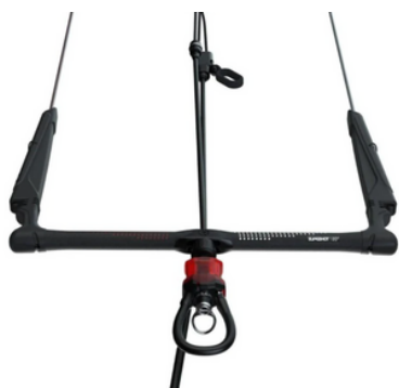
Slingshot 20cm kite bars