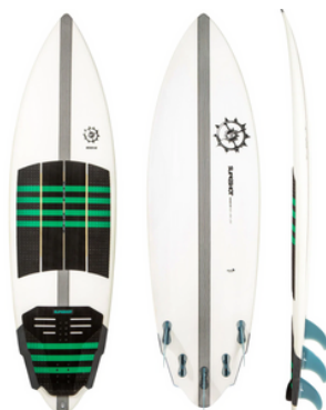
Slingshot Kite Boards Various sizes & styles available. With or without straps.