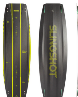
Twin Tips Various brands, sizes and models available.