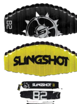
Slingshot B2 trainer kite