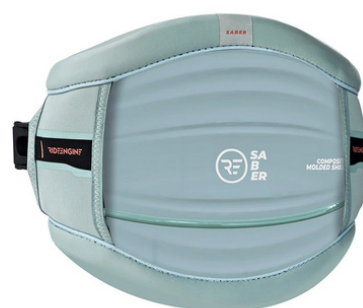
Ride Engine Sabre, Lyte & Momentum

Sizes xsmall, small, medium, large & xlarge